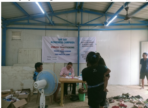
1. Doctor examining a Patient