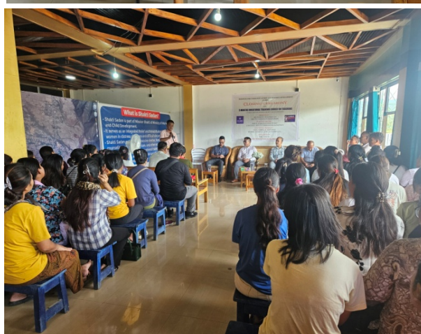
1. Closing Day of Voc. Training