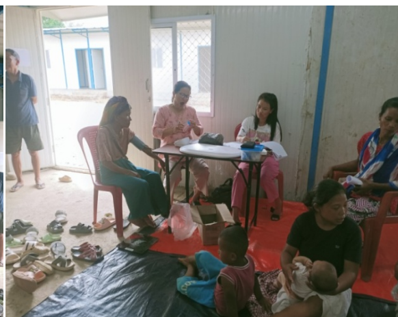
2. Lab attendants taking samples