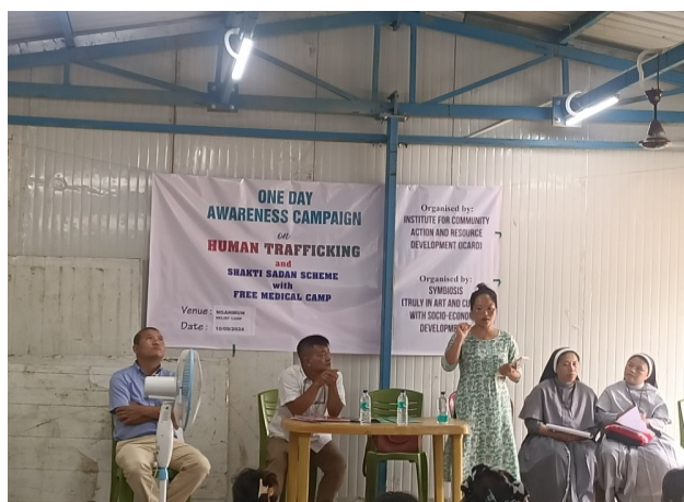
2. OSC Administrator speaking on SHAKTI SADAN