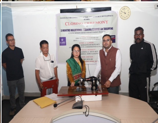
2. DC-Kpi giving away a machine to an IDP