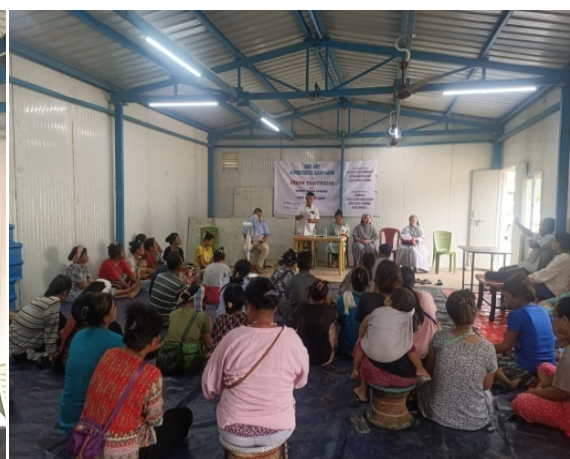
3. KEYNOTE by President-ICARD