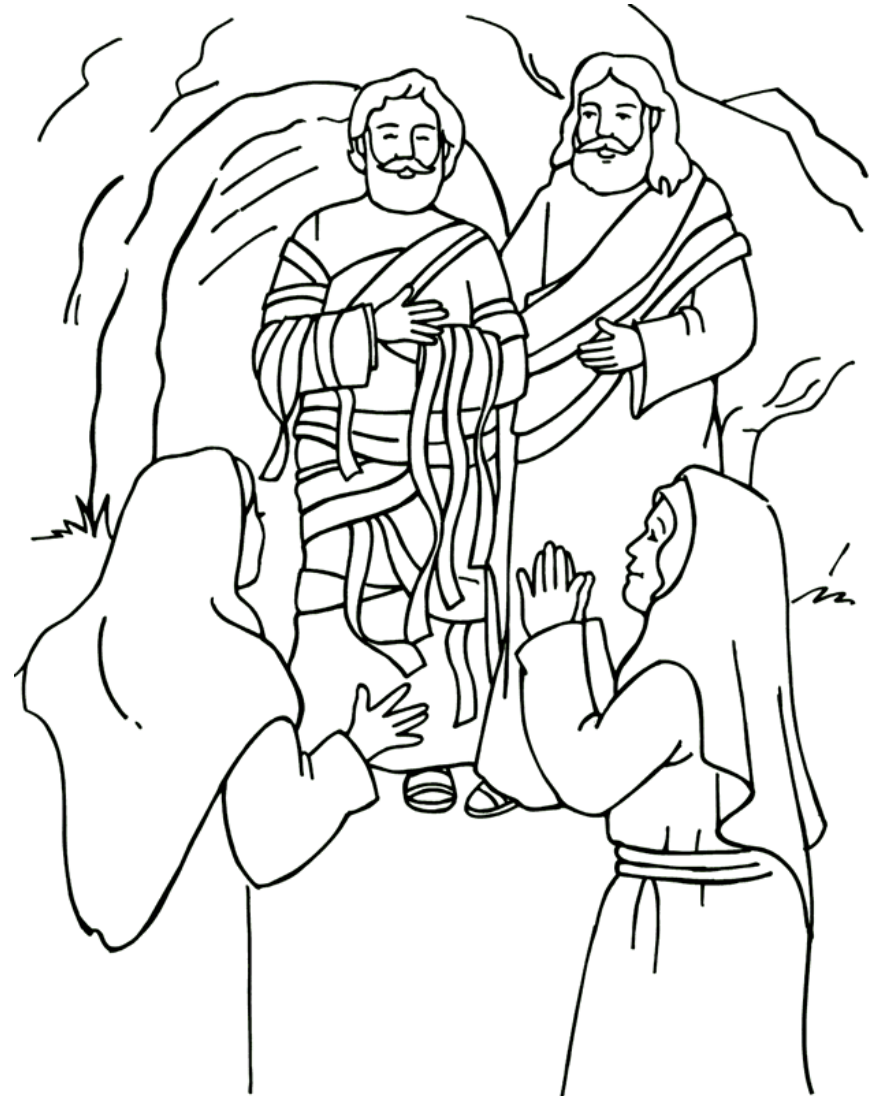
Jesus Raises Lazarus