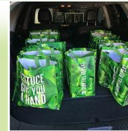
Meal Bags Transport

During the 2020 holidays, FFI was blessed to be able to provide nutritional support to ten (10) food-insecure families of 4 people with Thanksgiving Meal Bags and ten (10) families of 4 people with Christmas Meal Bags , which equates to eighty (80) family members receiving holiday nutrition.