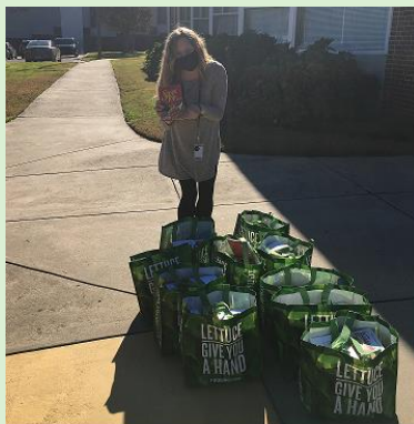
Meal Bags Delivery to Hunter Huss High School

FFI’s Food Insecurity – Pillar of Success - supports the holistic implementation of an “ quality of education ” model which is dynamically shaped to support at-risk participants and their families with the resources required for their journey towards Self-sufficiency .