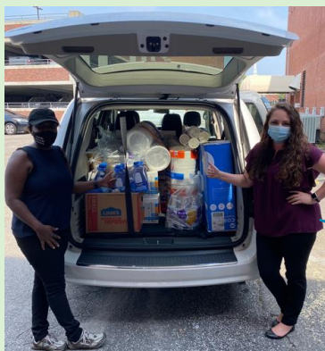
Supplies Delivery to The Cathy Mabry Cloninger Center

The Family FOCCUS Initiative community outreach team worked with Food Lion, we were able to raise the resources to support the Cathy Mabry Cloninger Center Domestic Violence Shelter with 55 unique items, across 11 categories, with a total volume of 1,947 supportive individual items.