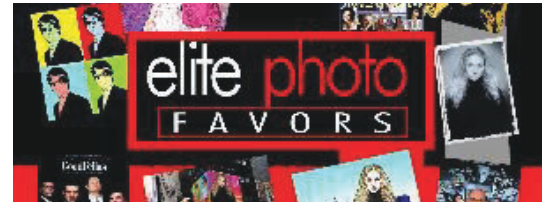
Photo booth and favors for all events

Answers to Who Knows: #1. A Fence #2. Light #3. Day and Night