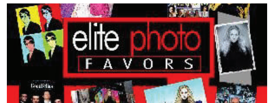
Photo booth and favors for all events

Veterinarian recommended All training aspects covered Will come to your residence Excellent references 516-767-0747 516-633-3384 www.alexhimel.info