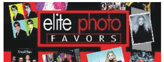
Photo booth and favors for all events

Veterinarian recommended All training aspects covered Will come to your residence Excellent references 516-767-0747 516-633-3384 www.alexhimel.info