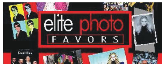
Photo booth and favors for all events

298 Main Street Port Washington, NY 11050 (516) 883-4164 paintingwithflowers@msn.com