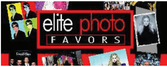
Photo booth and favors for all events

Veterinarian recommended All training aspects covered Will come to your residence Excellent references 516-767-0747 516-633-3384 www.alexhimel.info