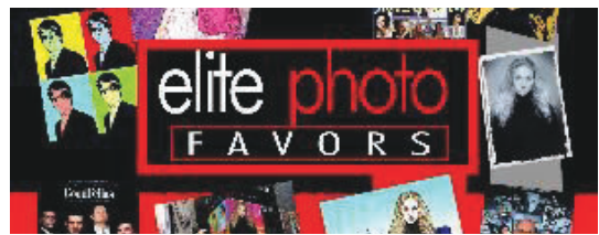
Photo booth and favors for all events