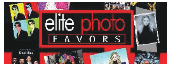
Photo booth and favors for all events

(Find the answers on the back, under "In The Stars")