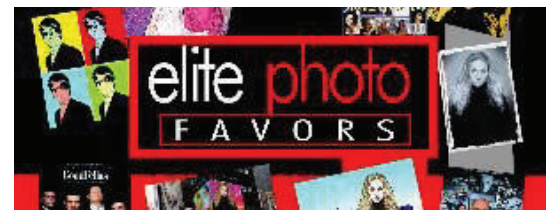
Photo booth and favors for all events

Veterinarian recommended All training aspects covered Will come to your residence Excellent references 516-767-0747 516-633-3384 www.alexhimel.info