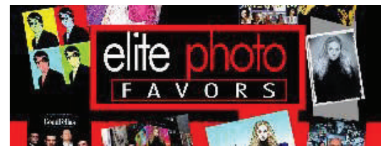
Photo booth and favors for all events

Veterinarian recommended All training aspects covered Will come to your residence Excellent references 516-767-0747 516-633-3384 www.alexhimel.info