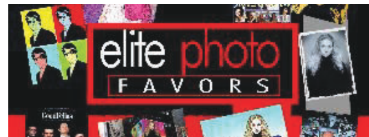
Photo booth and favors for all events