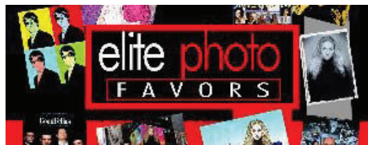
Photo booth and favors for all events

Veterinarian recommended All training aspects covered Will come to your residence Excellent references 516-767-0747 516-633-3384 www.alexhimel.info