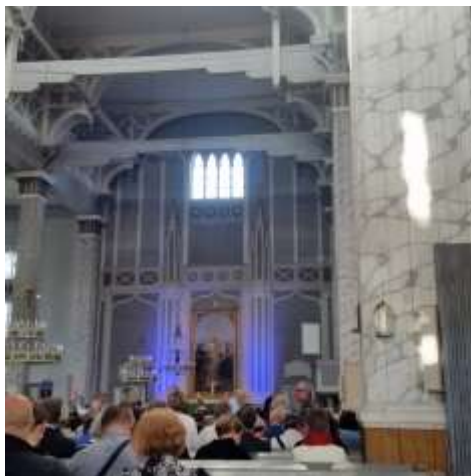
Interior of largest wooden church

The Male Voice Choir and Tapiola Children's Choir concert that evening was held at Kerimäki Church, the largest wooden church in the world, built in 1848 with seats for 3300 people. In the Finnish and Baltic tradition, the concert was a cappella. The encore, with both choirs distributed throughout the sanctuary, was a very moving rendition of Sibelius's "Finlandia" that had the audience hushed and in tears.