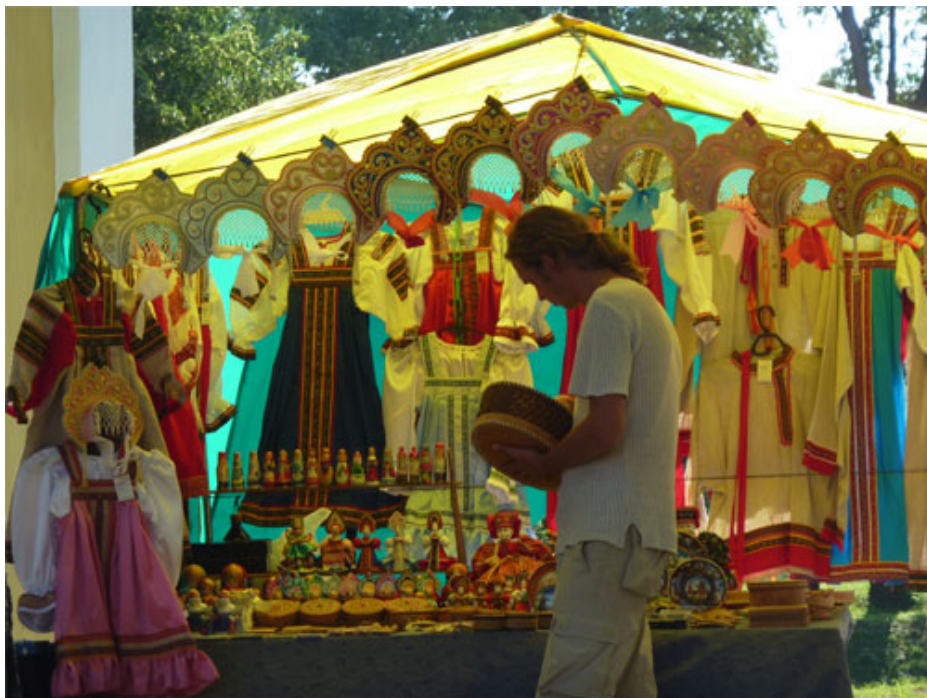
Photo taken in Uglich, one of the historic "Golden Ring" towns on the Volga River, reminiscent of Ancient Russia. One of many merchants selling traditional Russian crafts.