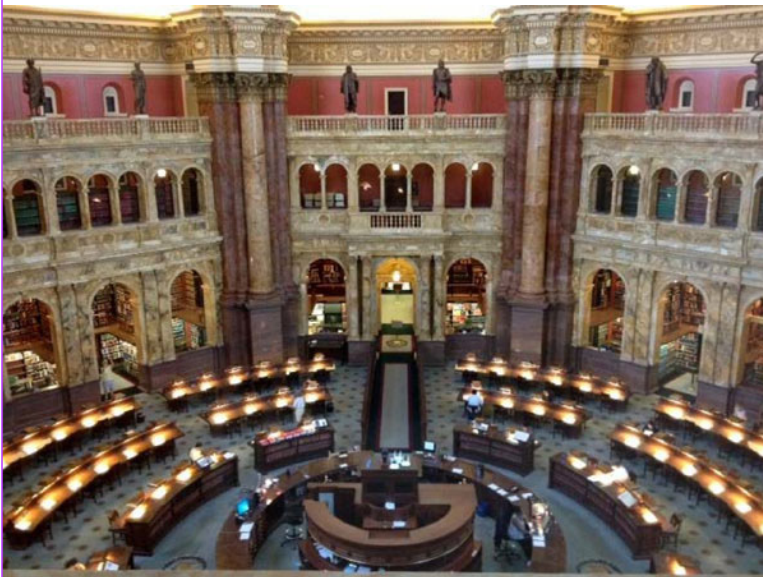
Reading Room at the Library of Congress

The Library of Congress impressed us with its high ceilings and holdings; the murals include a portrait of Francis Perkins.