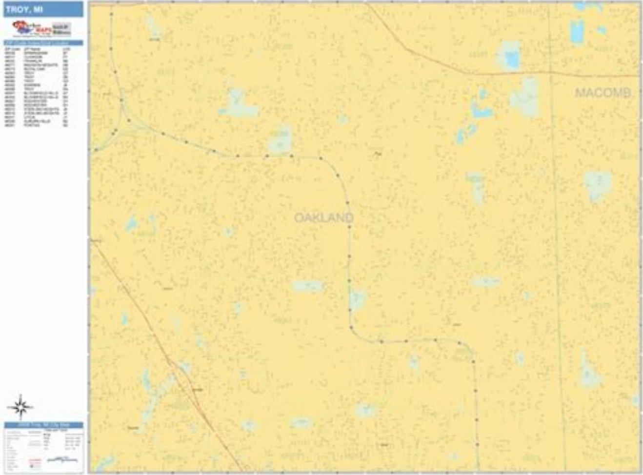
The Planning Department assists the City Manager in creating an environment for investment in the City of Troy and guides private and public development and redevelopment efforts.