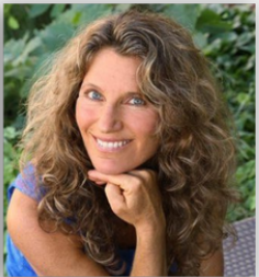
NCSOS Parenting Specialist: