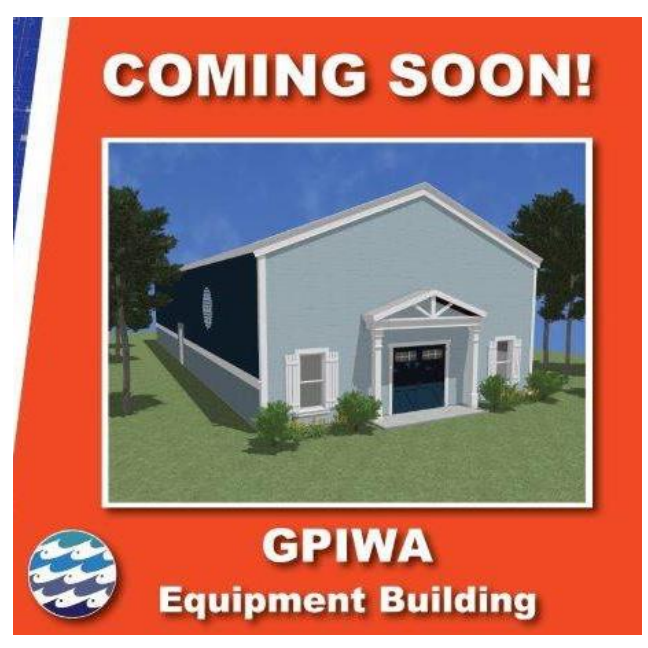
NEW EQUIPMENT BUILDING CURRENTLY UNDER CONSTRUCTION