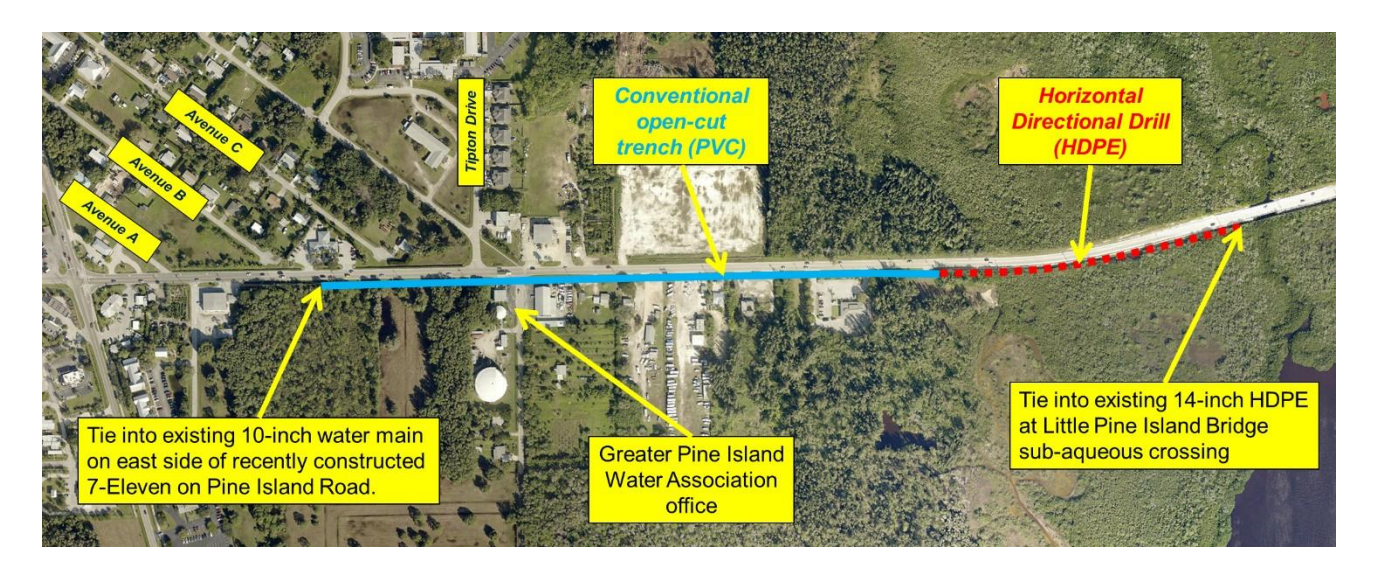
PINE ISLAND ROAD PHASE 1 WATER MAIN REPLACEMENT - CONSTRUCTION TO START IN 2020