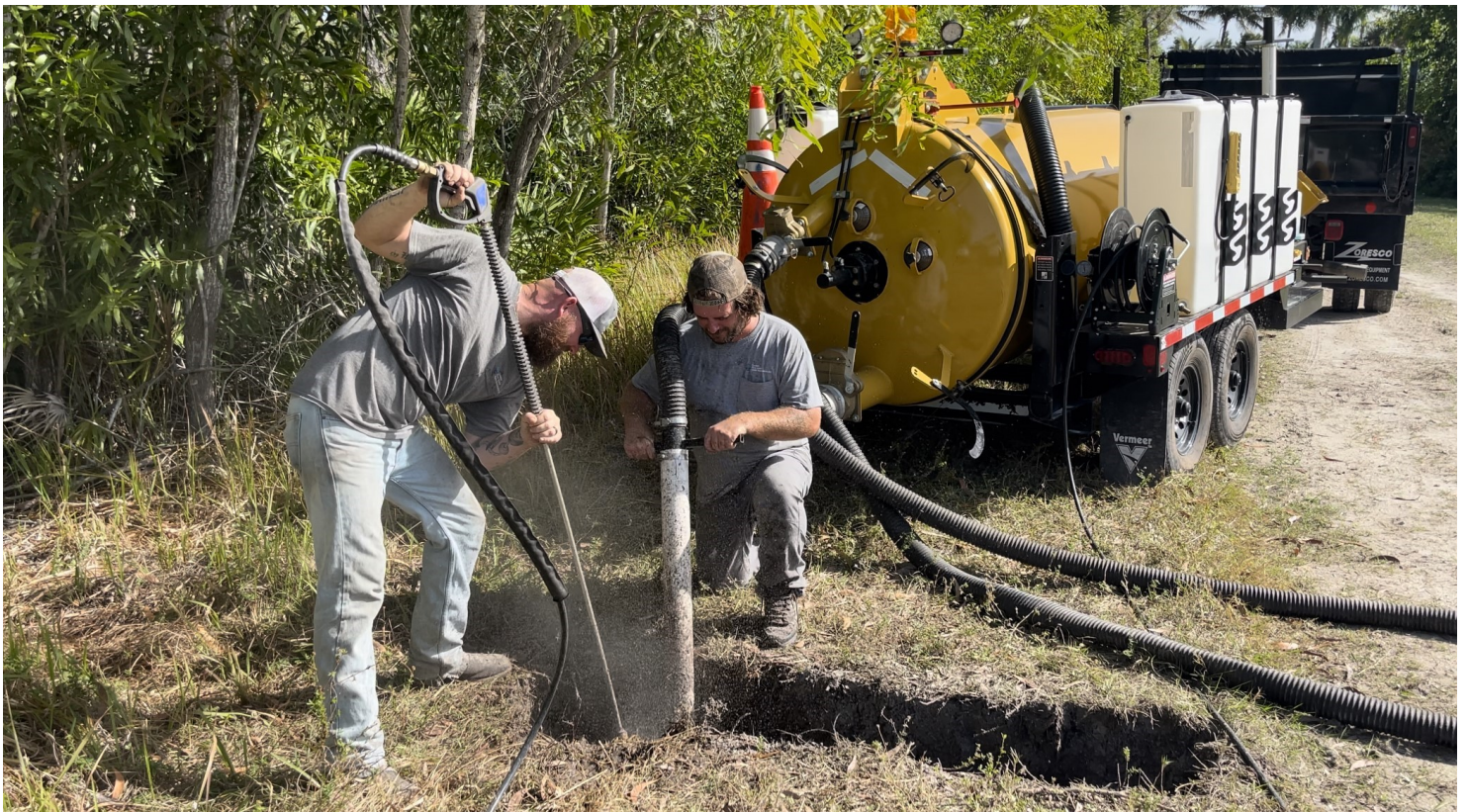
New Equipment for Distribution Department -Vacuum Excavator