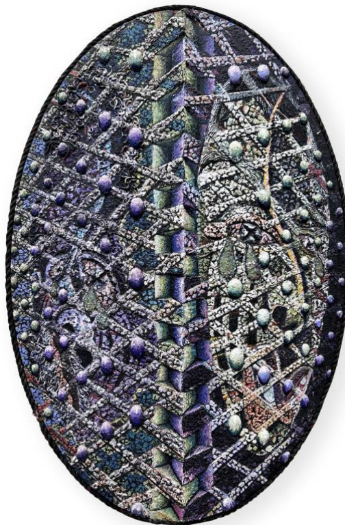
Jide Ojo, Tears of My Ancestors #2 , 1997, Mixed Media, 44" x 66"