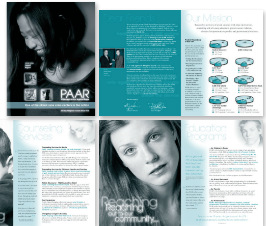
2003-2004 Annual Report, Pittsburgh Action Against Rape