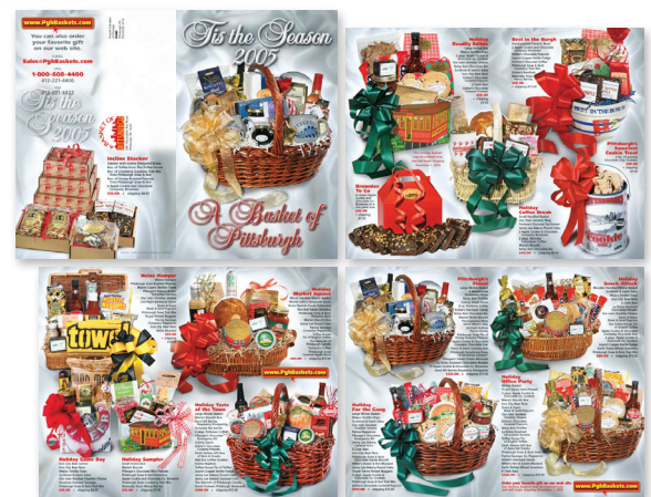
Tis the Season 2005, A Basket of Pittsburgh