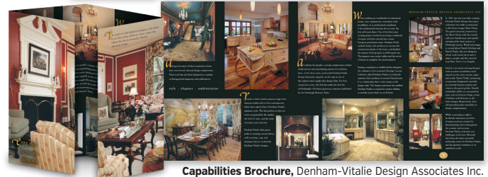
Capabilities Brochure, Denham-Vitalie Design Associates Inc.