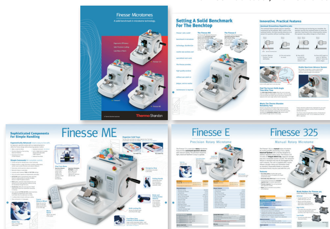
Finesse Microtomes Brochure, Thermo Shandon