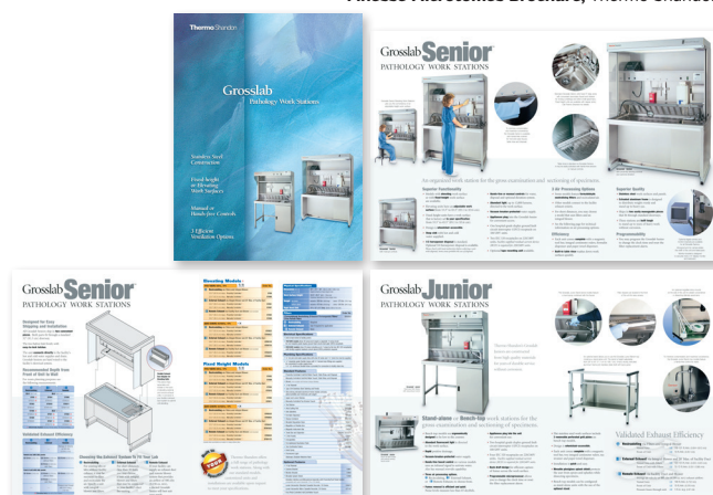
Grosslab Brochure, Thermo Shandon