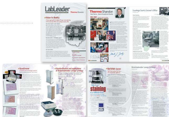
Fall 2001 LabLeader, Thermo Shandon