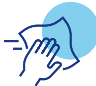
Cleaning & Sanitization

Learn more about these critical, and preventable, violations in our Common Health Code Violations infographic .