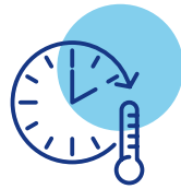
Time & Temperature