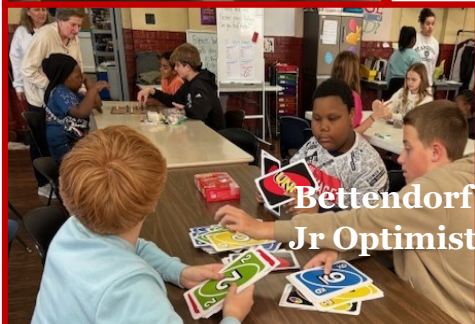
Bettendorf Jr Optimist