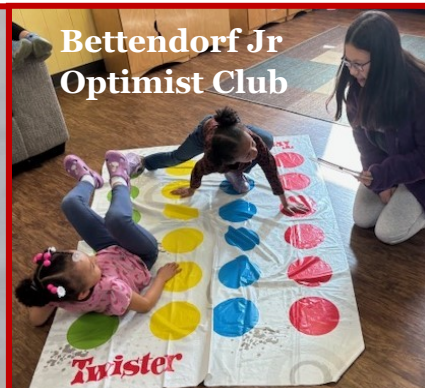
Bettendorf Jr Optimist Club