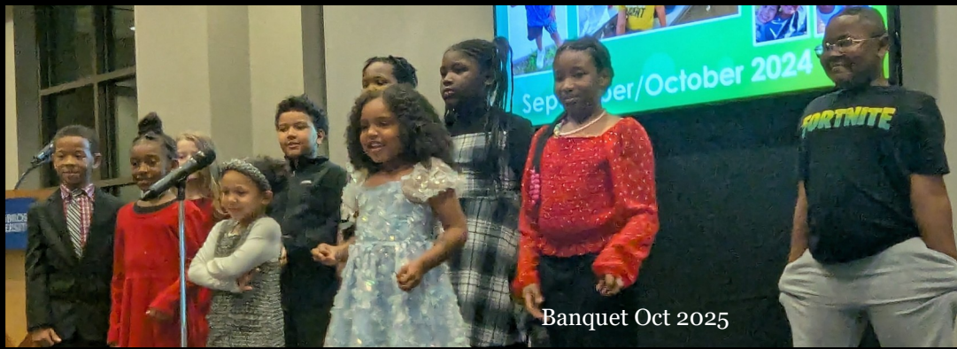
Banquet Oct 2025