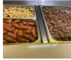
Scrambled Eggs, Longganisa, Pork Tocino, and Fried Bangus (below)

Salu-Salo Filipino Cuisine served a Filipino breakfast-style food for Brunch for a Cause. The menu included chicken adobo, pork tocino, longganisa, fried fish bangus, scrambled eggs, rice, fruits, and coffee.