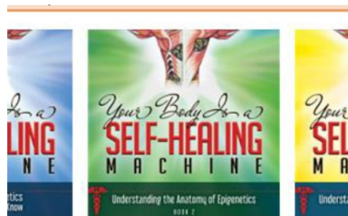
Your Body is a Self-Healing Machine, Books 1, 2, 3