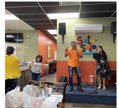
singing and dancing.