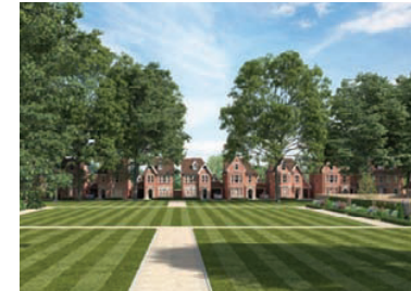
7 Broadoaks Park, Surrey 2, 3, 4, 5 & 6 Bedroom Houses Price from £625,000

The Metalworks has been designed for modern urban living – elegant, efficient and stylish. A mix of beautifully designed one bed and two bed apartments along with two bed duplex apartments in two striking buildings on the edge of Liverpool's vibrant commercial district and at the gateway to the city's most exciting regeneration zone.