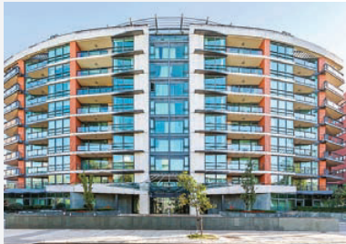
4 Pavillon Apartments, London 1, 2 & 3 Bedroom Apartments Price from £1,200,000

Chelsea Creek brings a characteristically European style of waterside living to central London. It is a truly exceptional new quarter of stunning apartments set around meandering waterways which flow through the heart of the development. Home in Chelsea lays West London's treasures in your lap. Shop endlessly on nearby King's road, Sloane street or Westfield.