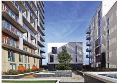
5 Spectrum, Manchester 1 & 2 Bedroom Apartments Price from £200,000

The Pavilion Apartments is one of St John's Wood's most sought-after purpose-built blocks and is situated on St John's Wood Road directly opposite Lord's Cricket Ground. The nearest underground station is St John's Wood (Jubilee Line) and Regents Park is within walking distance.