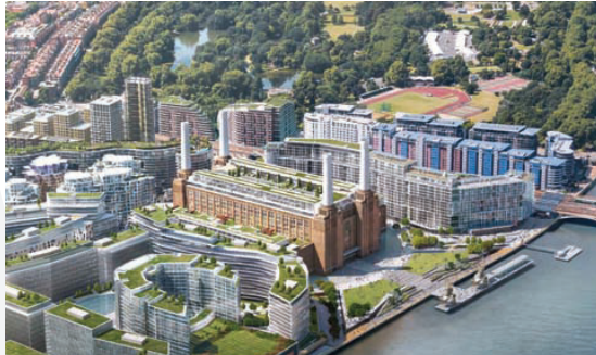
1 Battersea Power Station - London 1, 2 & 3 Bedroom Apartments Price £635,000

The iconic Grade II* listed building and surrounding area is being brought back to life as one of the most exciting and innovative mixed-use neighbourhoods in the world – a place for locals, tourists and residents to enjoy a unique blend of restaurants, shops, parks and cultural spaces.