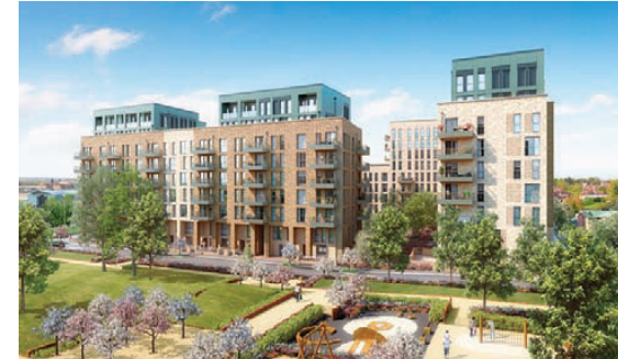
3 Chelsea Creek, London 1, 2 & 3 Bedroom Apartments Price from £850,000

A dynamic new development that is transforming the local neighbourhood, offering fantastic opportunities for anyone who wants to live in one of London's best-connected areas; Acton (Zone 3). Residents at Acton Gardens will be able to enjoy homes that have been built around newly designed communal gardens, parks and beautifully landscaped surroundings