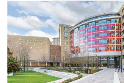
8 BBC Television Centre, London 1, 2 & 3 Bedroom Apartments Price from £850,000

Broadoaks Park is a unique and exclusive development offers a range of beautiful homes, from 2 bedroom apartments to spacious detached 6 bedroom family houses. The local amenities and West Byfleet train station are less than 1 mile, with a regular train service to London Waterloo from just 28 minutes.