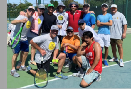
Men's Singles Flex Tournament 2023 BRC

The winds of change swept through tennis in 1972, marking the official replacement of the white tennis ball with the now-iconic yellow one. The world was transitioning to color TVs from black and white sets, and tennis dress codes took a cue. Colorful and casual court attire became the new norm.