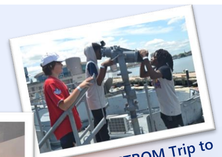
DC STORM Trip to Norfolk, VA