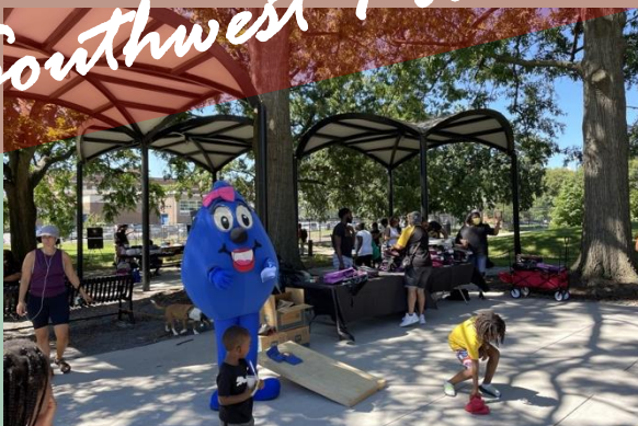
Alpha Phi Alpha Community Day

For a quarter of a century, Friends of Southwest DC has made grants to support educational, charitable, and community development activities in our Southwest neighborhood. 2023 marks our 25 th anniversary! Since 1998, we have awarded grants totaling $401,812 to more than 40 organizations working to make Southwest a better place. Because all our work is done by a volunteer Board of Directors, we keep administrative costs extremely low—about 3%—making Friends of Southwest DC one of the most cost-effective champions of our community.