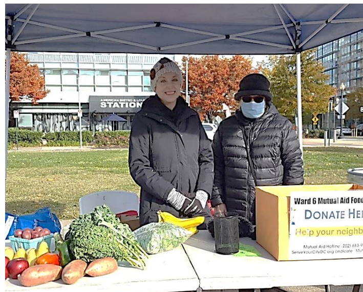
Farmers' market volunteers collect for the CUMC food bank, a Friends of Southwest DC grant recipient.

The fundraising committee explored various new options of reaching out and meeting neighbors this year. We sponsored several “Metro Meet-Ups,” in which we greeted morning commuters with information about our organization. We also joined forces with SWNA several times at the Saturday Farmers Market in the fall. As an organization, we have decided to continue and to amplify these outreach efforts. We are optimistic that we will be able to show a more consistent community presence in the spring and summer months.