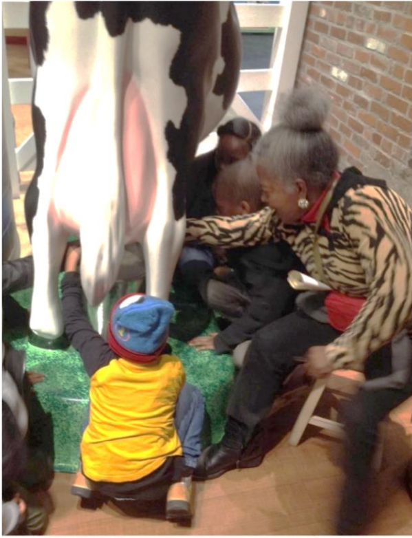
★ Columbia, PA – dairy farm