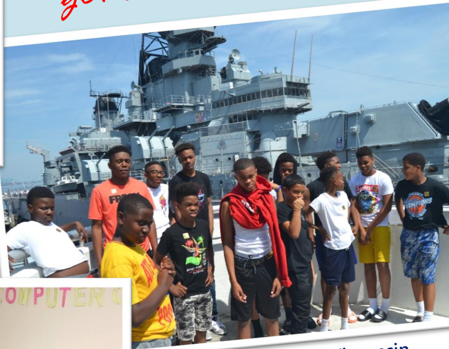
★ Norfolk, VA – USS Wisconsin