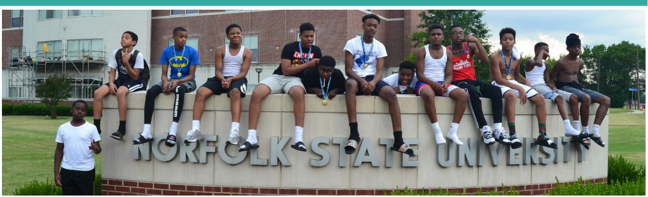
Grantee photo: DC STORM

Omicron Eta Lambda chapter of Alpha Phi Alpha Education Foundation: In support of the Annual Southwest Community Day taking place in Lansburgh Park, the grant provided backpacks and school supplies to students in the community. The focus of the Community Day was Health and Education. This event successfully served over 400 attendees from the community.