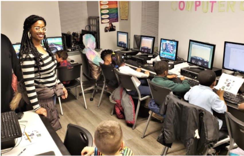
★ Southwest DC– computer lab

These are just some of the many young people who benefitted from our educational grants. Enjoy more grantee stories and photos at FriendsofSWDC.org .