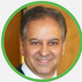
Jack Dispenza Design Results, LLC