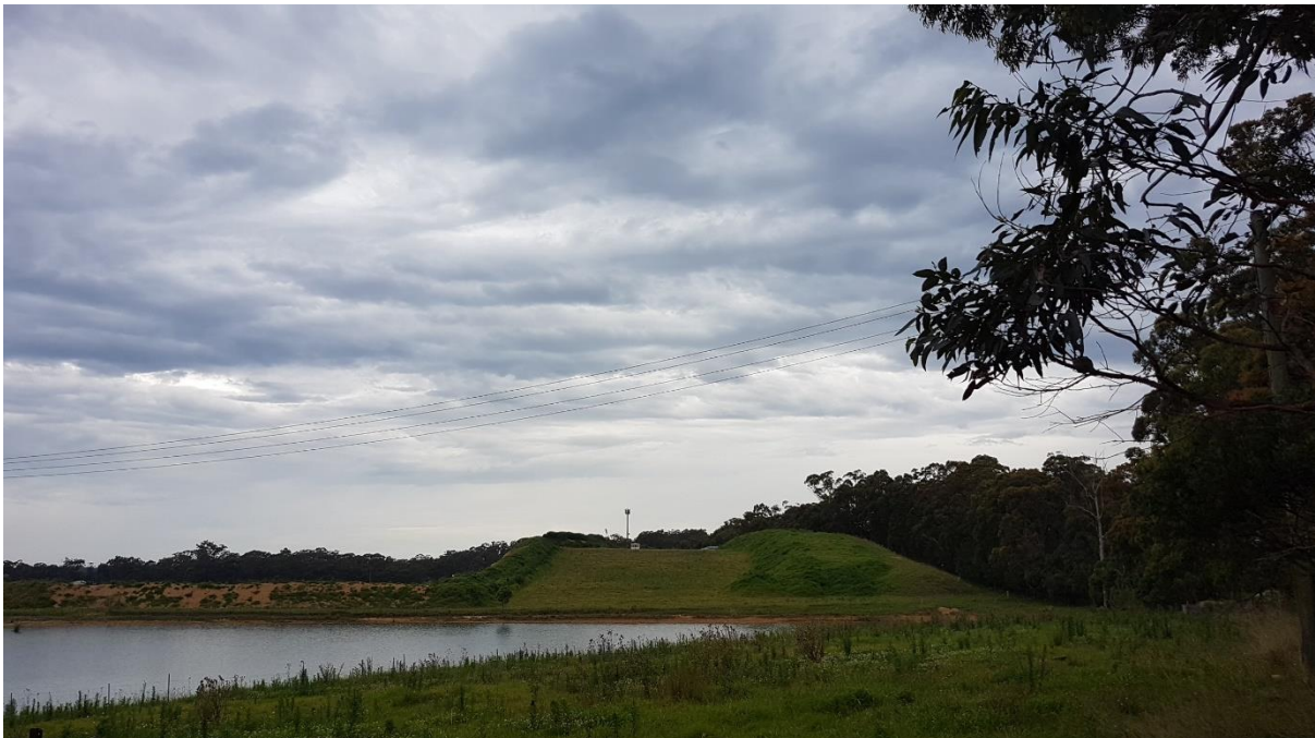
Figure 5. Agricultural land along Old Northern Road in the west/south west of the site

A plant nursery is established in the far north western corner of the site. The nursery makes use of water in the farm dams located on site. The agricultural land directly to the east of the nursery site is dominated by exotic grass species suitable for livestock grazing. One WoNS was identified to occur in this location, Fireweed Senecio madagascariensis .