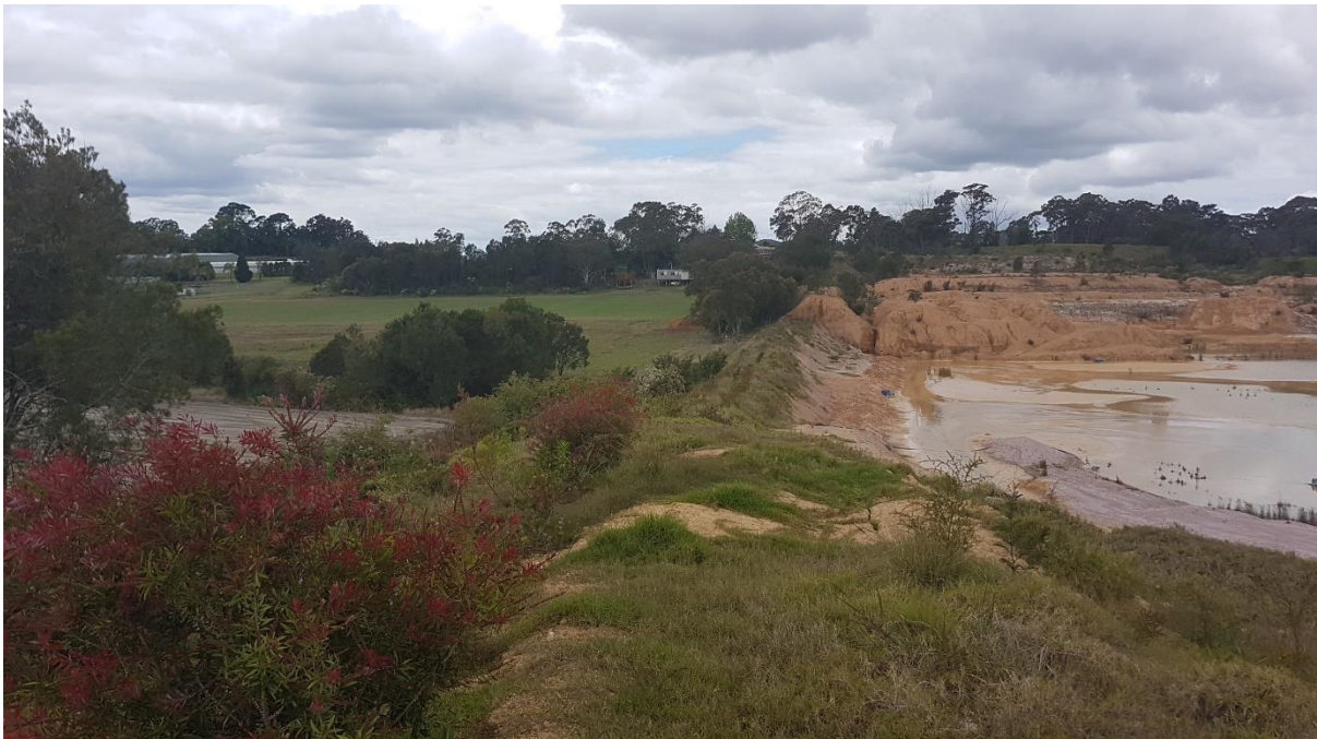
Figure 8. Planted native vegetation along northern property boundary

A variety of Bottlebrush Callistemon species have been planted in two locations along the northern boundary of the property. Exclusion fencing has been undertaken and success to date appears to be high. There were two WoNS species present along the fence line of the neighboring property, Lantana camara and Blackberry Rubus fruticosus sp. aggregate .