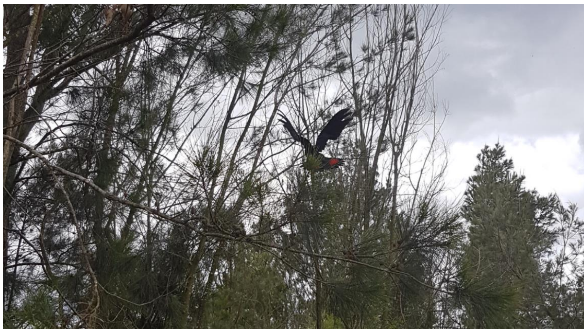
Figure 11. Glossy Black Cockatoo within the Allocasuarina littoralis on the northern boundary

Overall the condition of habitat for native fauna species within the property is considered to be low in its current state. The remnant native vegetation areas currently have the most habitat value to support a range of native fauna species however this area is small and not likely to be large enough to support any viable population. Connectivity to native vegetation in all directions is broken due to road easements or surrounding agricultural land use.