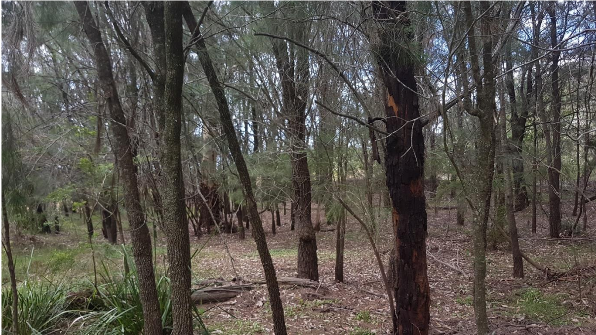
Figure 1. Remnant vegetation located immediately north of Roberts Road site entry gate.