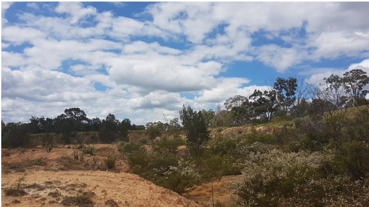
Figure 2. Remnant vegetation located in the north eastern corner of the site.

Leaf litter is abundant throughout most of this area however fallen timber and size class of canopy species is limited.