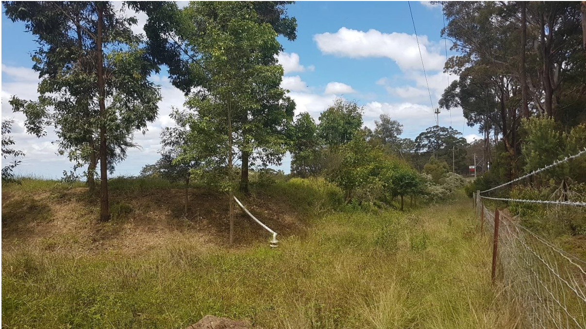
Figure 7. Planted native vegetation along Old Northern Road