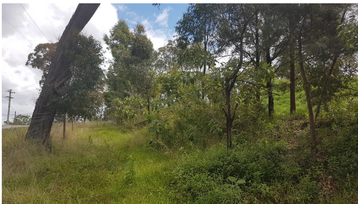
Figure 3. Bund wall adjacent to Roberts Road.

The native species which have been planted on a bund wall bordering Roberts Road and Old Northern Road are growing well thanks to the return of regular rainfall. Many of these species have reached reproductive maturity and have had a strong flowering season this year.