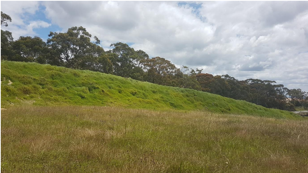
Figure 4. Agricultural land with grassed bund wall adjacent to Old Northern Road