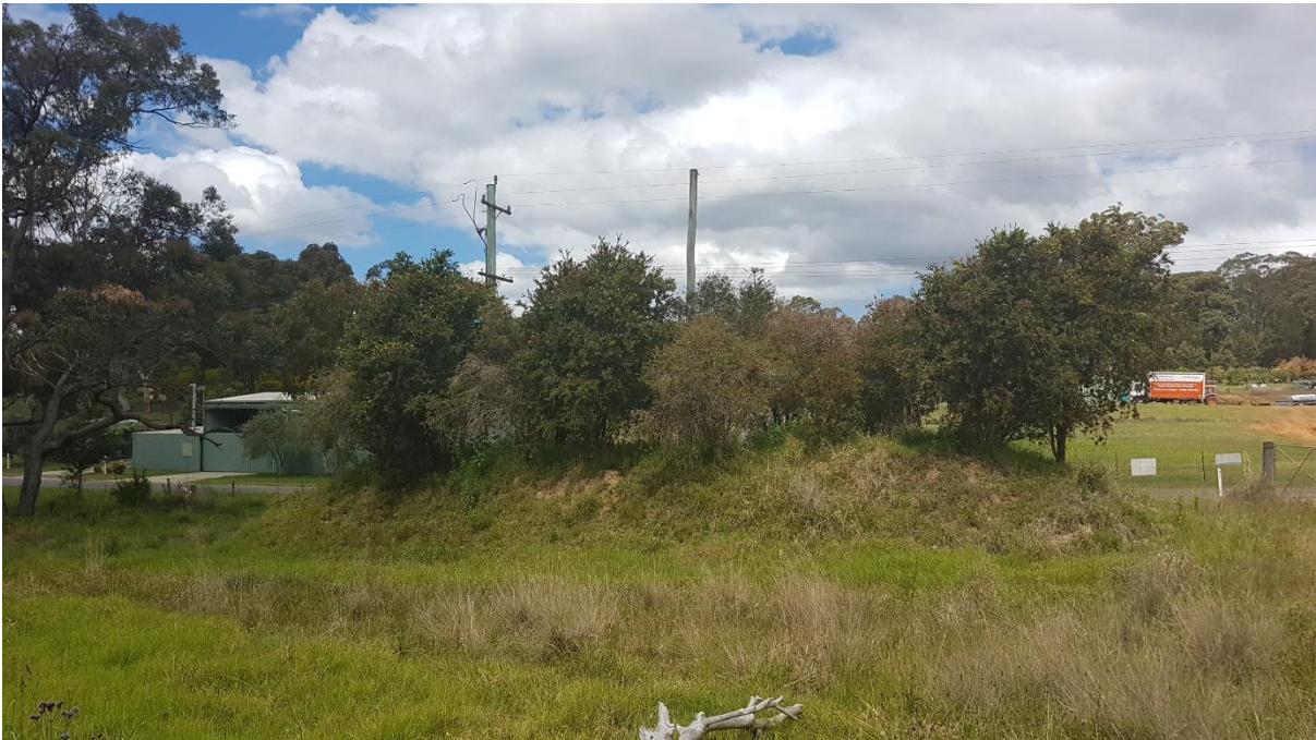
Figure 6. Bund wall immediately north of Roberts Road site entrance

Bottlebrush Callistemon species have been planted along the eastern boundary of the property adjacent to the existing native vegetation. These shrubs are well established and provide a screen to Roberts Road. The shrubs provide habitat for small birds and food resources for a range of mammals, birds and invertebrate.