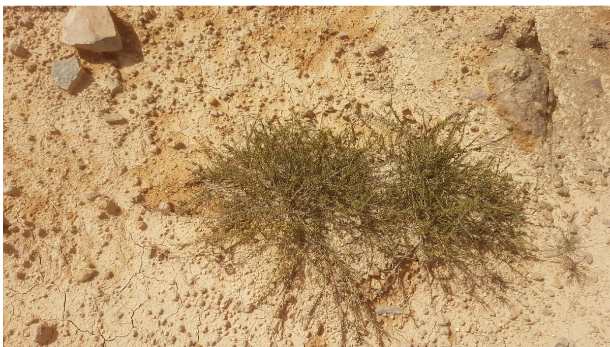
Figure 9. Acacia bynoeana identified and located onsite

No other threatened flora species were identified onsite.