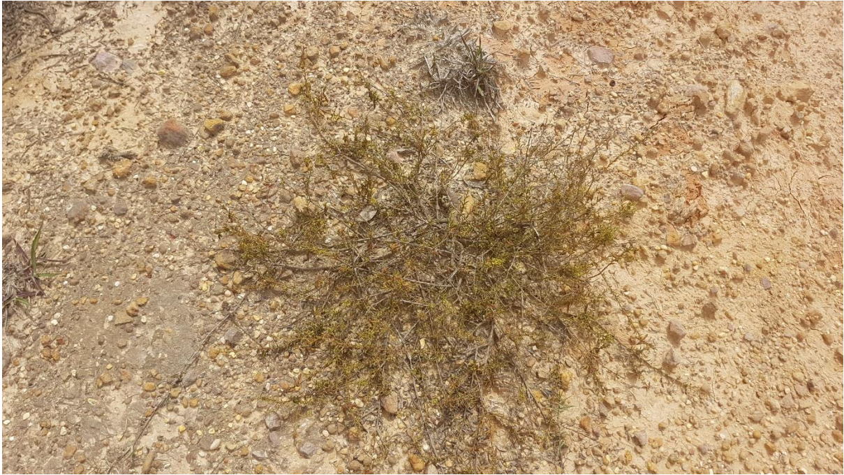
Figure 10. Acacia bynoeana identified and located onsite