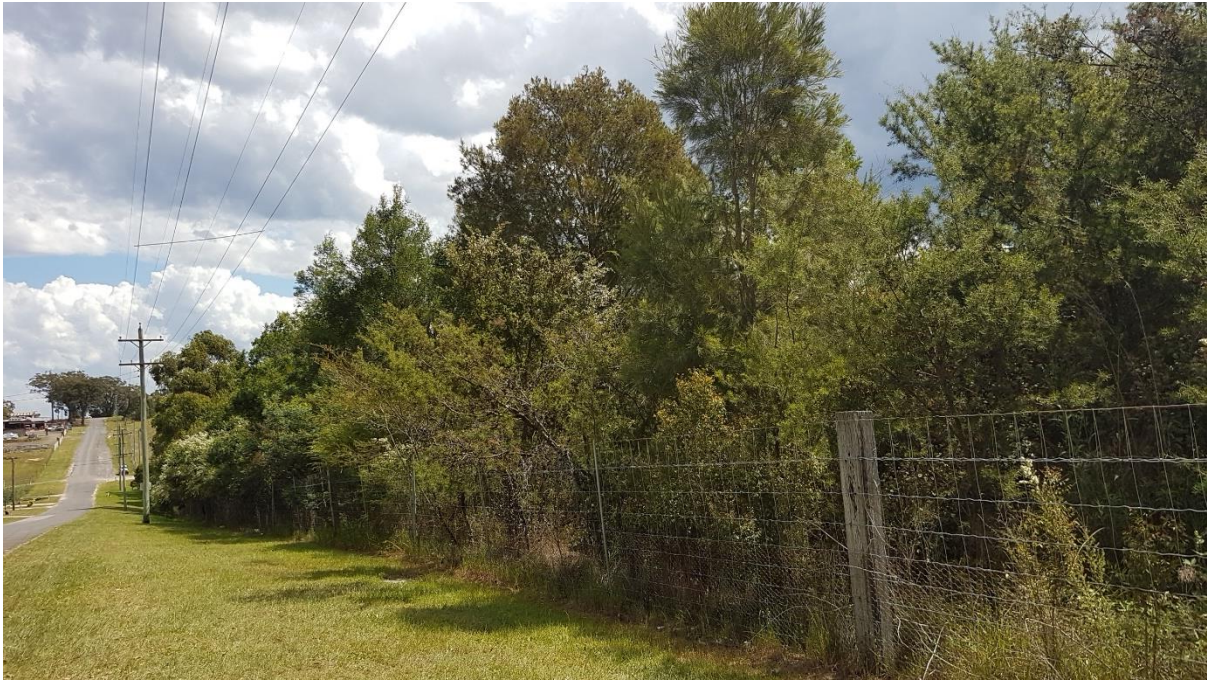
Figure 2. Remnant vegetation located in the north eastern corner adjacent to Roberts Road Oct 2021