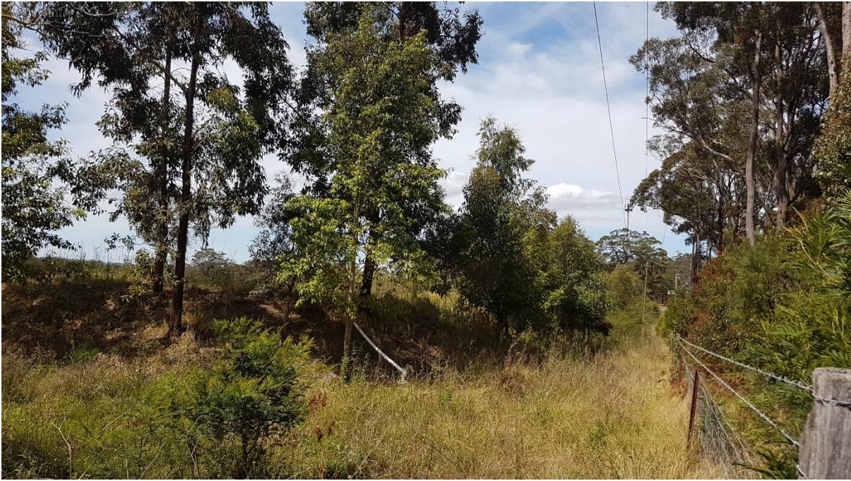
Figure 7. Planted native vegetation along Old Northern Road