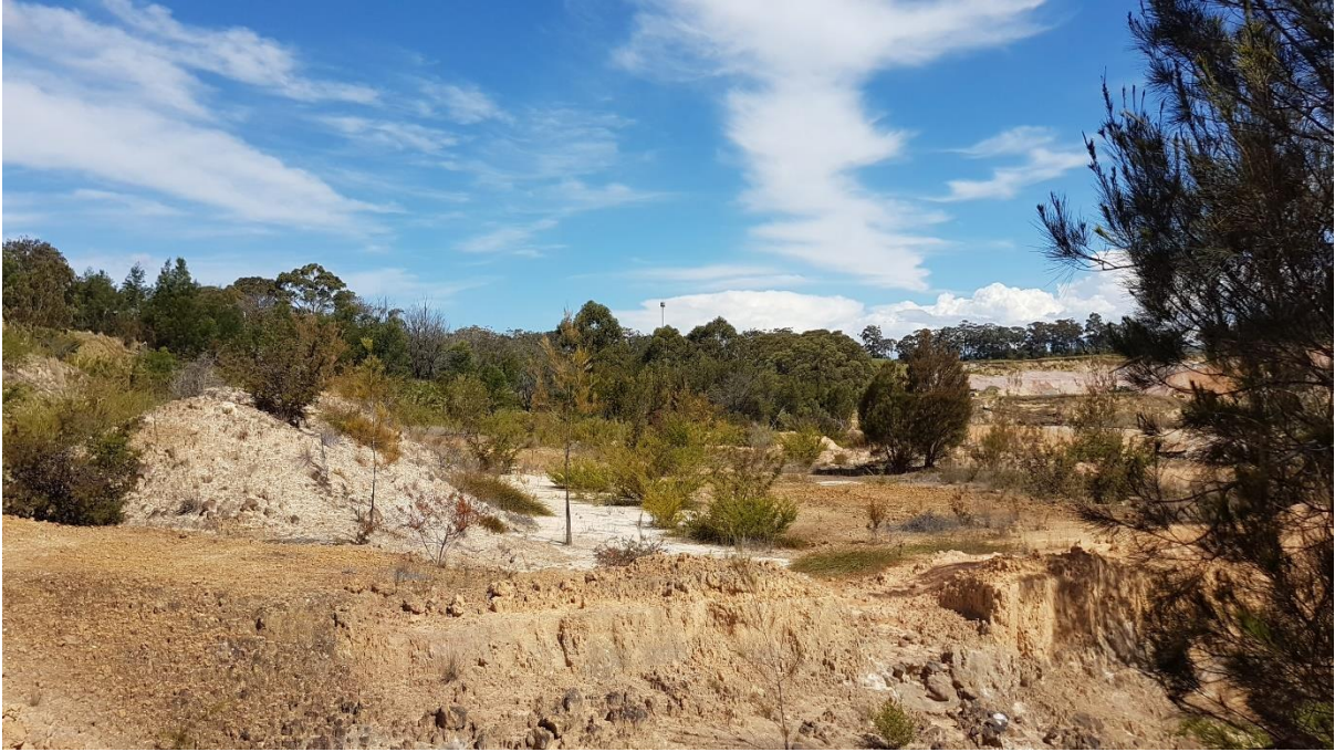
Figure 10. Typical habitat where Acacia bynoeana has been identified and located onsite