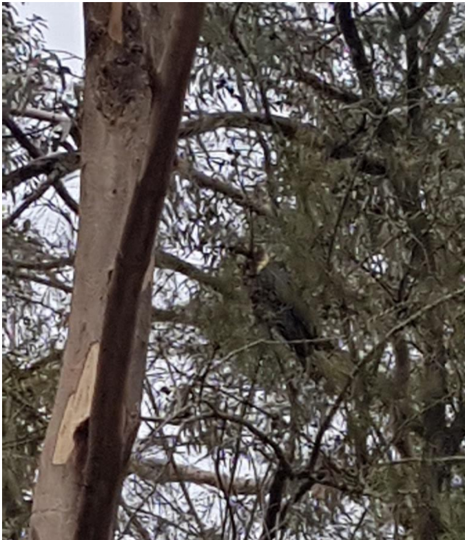
Figure 12. Glossy Black Cockatoo within the Allocasuarina littoralis on the northern boundary

Overall the condition of habitat for native fauna species within the property is considered to be low in its current state. The remnant native vegetation areas currently have the most habitat value to support a range of native fauna species however this area is small and not likely to be large enough to support any viable population. Connectivity to native vegetation in all directions is broken due to road easements or surrounding agricultural land use.