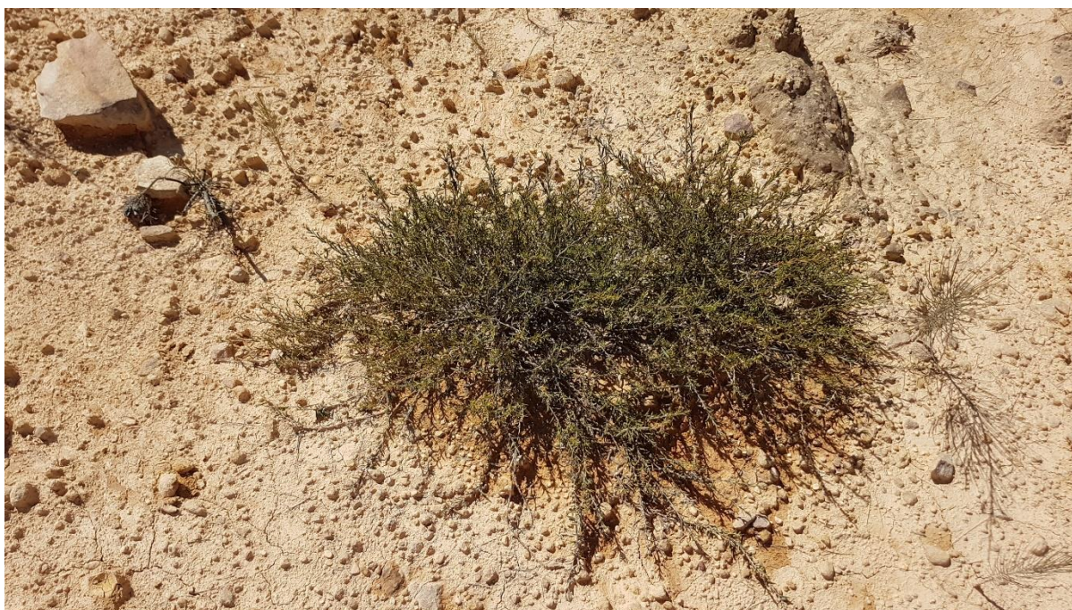
Figure 9. Acacia bynoeana identified and located onsite

No other threatened flora species were identified onsite.