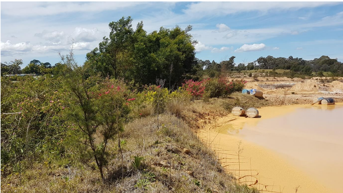
Figure 8. Planted native vegetation along northern property boundary

A variety of Bottlebrush Callistemon species have been planted in two locations along the northern boundary of the property. Exclusion fencing has been undertaken and success to date appears to be high. There were two WoNS species present along the fence line of the neighboring property, Lantana Lantana camara and Blackberry Rubus fruticosus sp. aggregate.