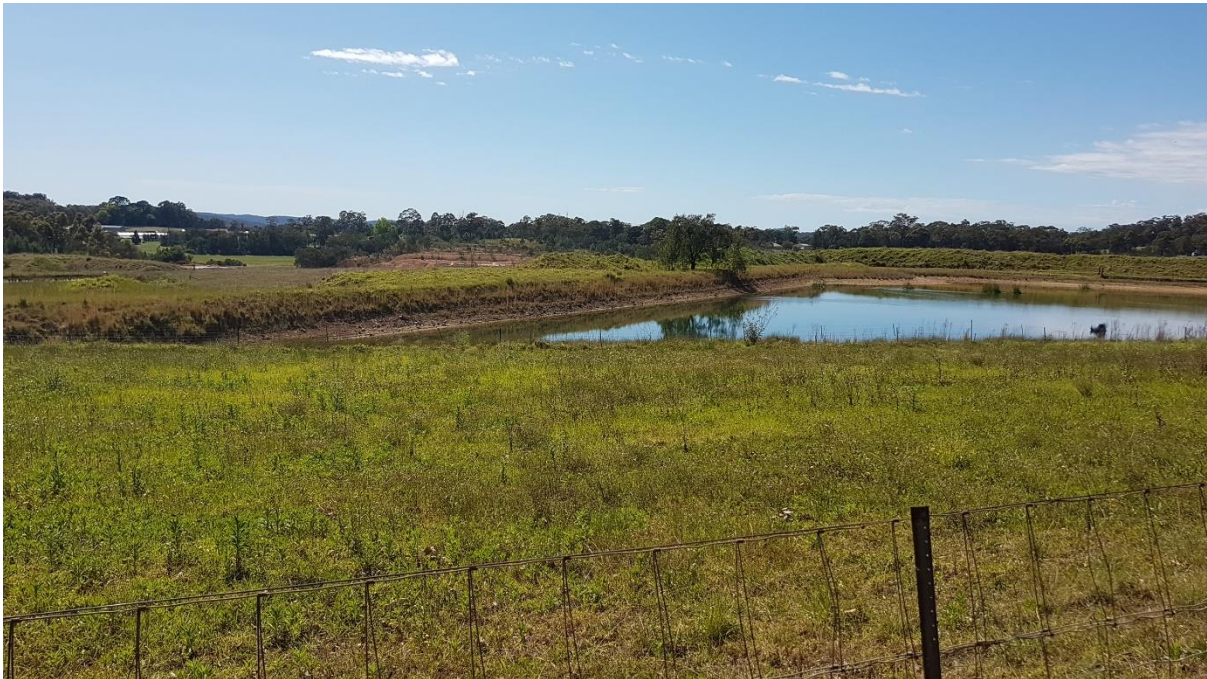
Figure 5. Agricultural land along Old Northern Road in the west/south west of the site

A plant nursery is established in the far north western corner of the site. The nursery makes use of water in the farm dams located on site. The agricultural land directly to the east of the nursery site is dominated by exotic grass species suitable for livestock grazing. One WoNS was identified in low density in this location, Fireweed Senecio madagascariensis .