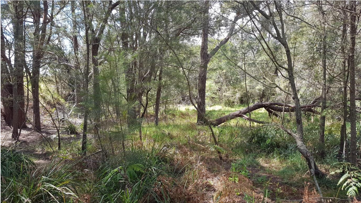
Figure 1. Remnant vegetation located immediately north of Roberts Road site entry gate Oct 2021