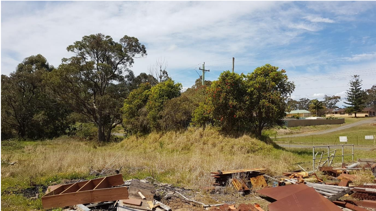
Figure 6. Bund wall immediately north of Roberts Road site entrance

Bottlebrush Callistemon species have been planted along the eastern boundary of the property adjacent to the existing native vegetation. These shrubs are well established and provide a screen to Roberts Road. The shrubs provide habitat for small birds and food resources for a range of mammals, birds and invertebrate.