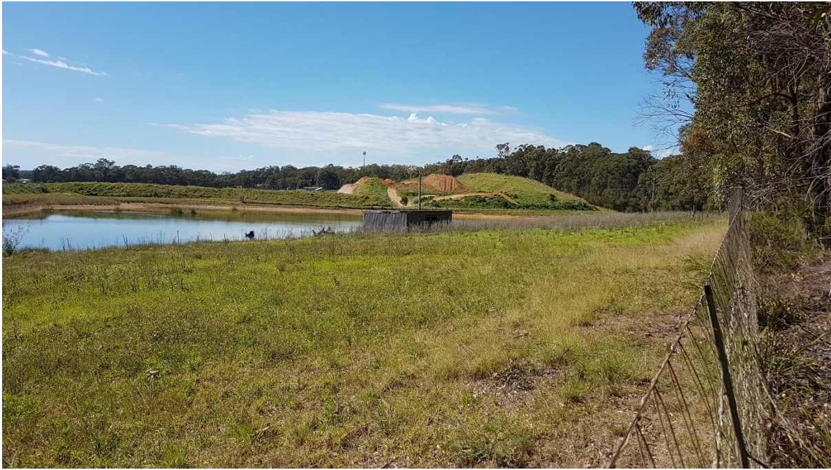
Figure 4. Agricultural land with grassed bund wall adjacent to Old Northern Road