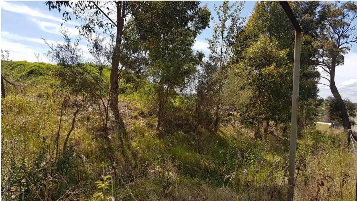
Figure 3. Bund wall adjacent to Roberts Road.

The native species which have been planted on a bund wall bordering Roberts Road and Old Northern Road are growing well. Almost all of these species have reached reproductive maturity and have had a strong flowering season this year.