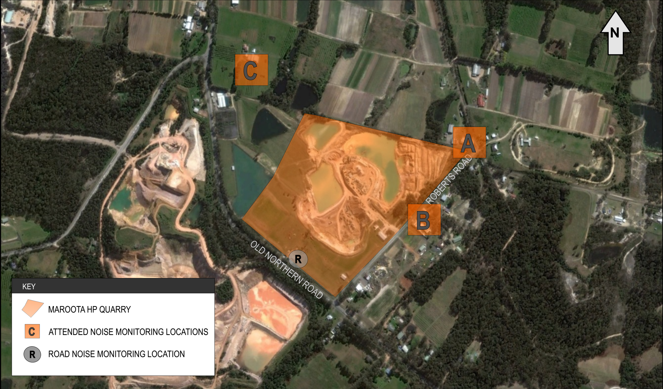
FIGURE 1 - LOCALITY PLAN