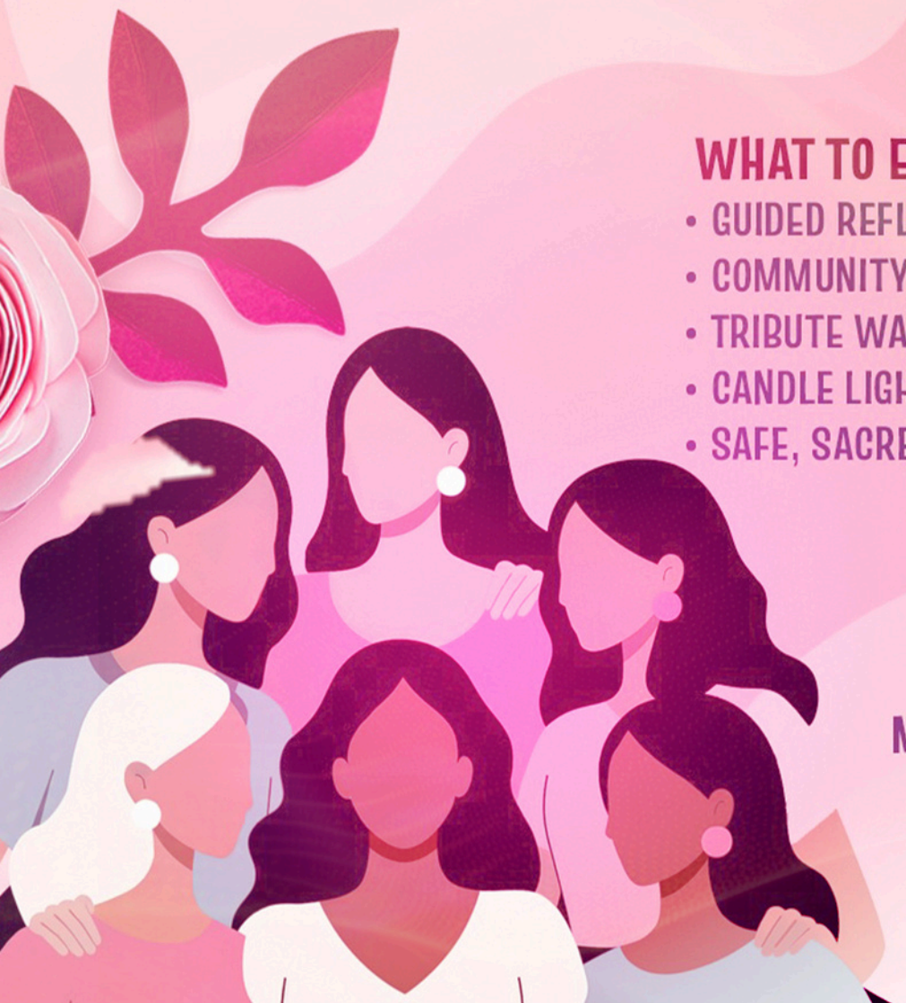
PHOTO SUBMISSIONS FOR THE TRIBUTE WALL DUE BY MAY 6, 2025 • THIS IS A SHOELESS SPACE — PLEASE WEAR SOMETHING COMFORTABLE

3624 MAYFIELD RD. CLEVELAND HTS, OH 44118