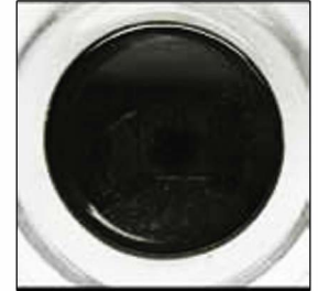
Top view of the beaker at 30 minutes and two hours.