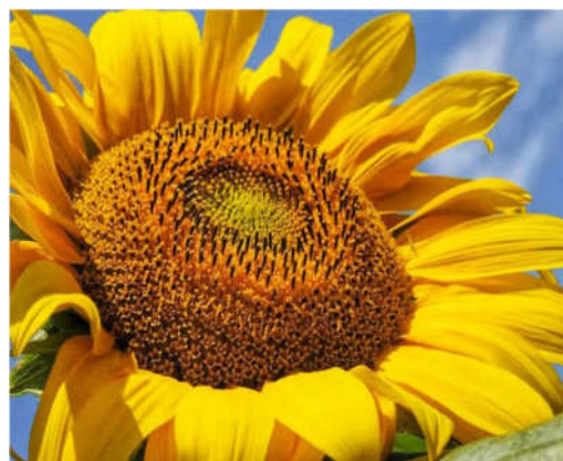
Russian Giant Sunflower

Sunflower - ( Helianthus , all species) There are over 50 varieties of annual and perennial sunflowers that are favorites for seed loving birds, humans and various animals. They love the sun, are easy to grow, and are drought tolerant.