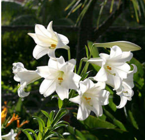
Easter Lily ( Lilium longiflorum )

Lilies in the Garden - They are a lovely family of trumpet shaped flowers the Easter Lily, Gloriosa Lily, Amazon Lily, and Spider Lily. These are a few that we will highlight. They are all bulbs, perennials, and each has its own special appeal.