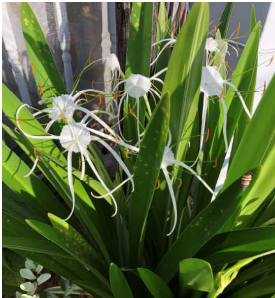
Spider Lily ( Hymenocallis latifolia )

An accent plant that forms compact rosettes of deep green, glossy leaves and tall spikes of fragrant, long lasting, waxy, white flowers. It can be used as a ground cover or a potted plant in a shady area.