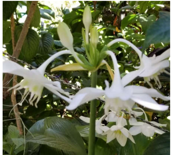
Amazon Lily ( Eucharis amazonica )

The Easter lily symbolizes the new life of Spring. Plant in a well-drained sunny location. When they die back, cut the stems back to the soil surface. To prolong the life of each flower, remove the yellow anthers before they begin to shed pollen.