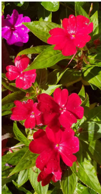
Red New Zealand Impatiens