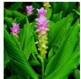
Siam or Tulip Ginger ( Cucuma alismatifolia )

“Once established, these Florida-Friendly plants little care aside from watering.” This is a family of unique flowers that put on quite a show in the garden.