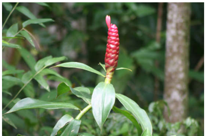
Indian Head Ginger ( Costus woodsonii mass )