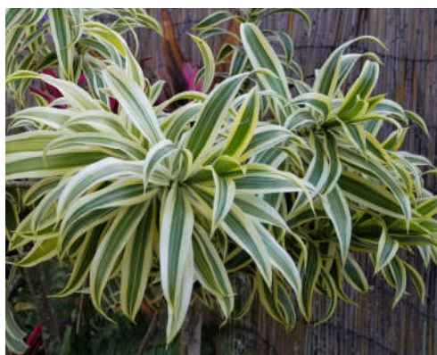
Song of India

Caladiums are seasonal bulbs available in a variety of white/green and red/green