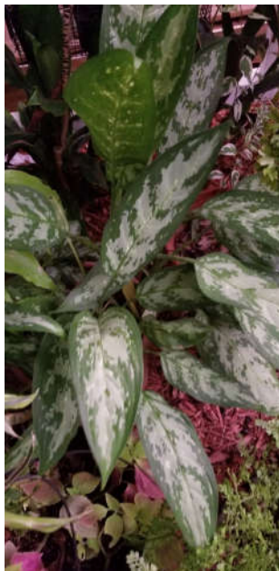
Chinese Evergreen ( Aglonema ) This plant likes the shade.

An easy way to add interest to your landscape is by adding plants with variegated leaves. Here are some easy plants to grow: Song of India, Trinetta, and Flax Lilly. To compliment these, use with dark green foliage plants or for color pair with bromeliads and caladiums. Some other variegated plants that you might like are the arrowhead syngonium, crinum lily, dracaenas, or Aztec grass (12 to 18" tall). All are easy to grow and propagate. We'll be talking more about these in our next meeting.