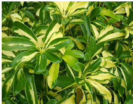
Shefflera Arboricola Trinetta

This is a popular landscape plant that grows very well in South Florida. It adds interest to a landscape.