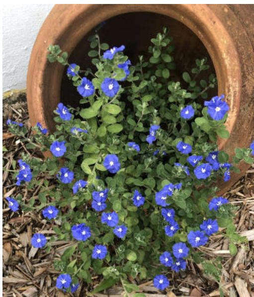
Blue daze ( Evolvulus glomeratus )

Blue Daze ( Evolvulus glomeratus ) is another perfect plant for our hot and humid South Florida weather and once established does not need additional watering. It grows best in full sun but will tolerate partial shade. In zones 10-11 it is a perennial. It only grows to about a foot tall with dense growth and makes a nice ground cover or can cascade out of a pot or hanging basket. It is a dynamic blue plant that can be used for contrast or as a focal point. It is available at your local nursery or can be propagated by cuttings. it is a non-stop bloomer.