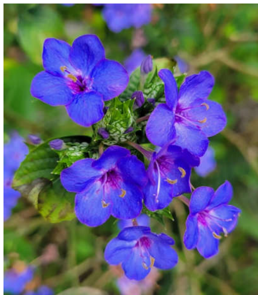
Blue Sage ( Eranthemum pulchellum )

Blue Sage ( Eranthemum pulchellum ) is a perennial that blooms in the early winter, like right now in February. It is a small spreading shrub and can grow to 6 ft. but if you cut it back each year after it blooms, it will only be about 3 ft. tall and will give more blooms. It is care free and easily propagated by soft wood cuttings. The one pictured is planted on the north side of the house. In the summer it gets lots of sun but is in complete shade in the winter and it loves the location.