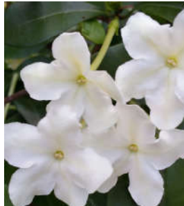
Lady of the Night ( Brunfelsia americana )

Lady of the Night ( Brunfelsia americana ) This is a small bush that grows 4-6 feet tall. These tube-like flowers give off a beautiful fragrance at night. It is easy to grow. Give it a sunny to part sunny location. It blooms repeatedly throughout the year and is blooming now.