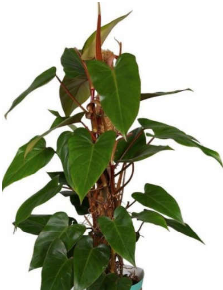
Philodendron Red Emerald

from cuttings and division. Most are grown in the shade. Handle carefully as the juice from the stems can irritate the skin. These plants are so common that we tend to forget the beauty and tropical feel they can add to any garden.