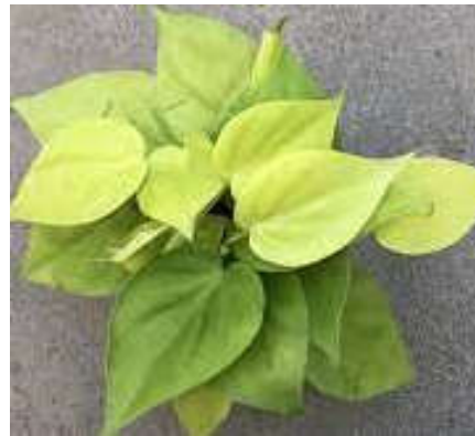
Philodendrom Cordatum Neon - heart shaped, trailing vine with yellow green leaves.

Has deep new red leaves and stems, and with age, the leaves turn dark green. Loves to grow up trees.