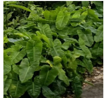
Philodendron Burle Marx –

With over 489 varieties give them a try!