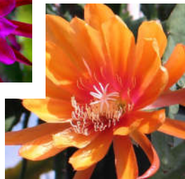
Epiphyllum Hybrids – Orchid Cactus

Epiphyllum oxypetalum, Queen of the Night is the most popular of the night blooming cactus. They are native to rain forest, so they need more water than other succulents. The key to frequent blooming is to feed them regularly, give them partial sun, and allow them to be slightly root-bound. They do not have leaves but stems that have flattened. The blooms last one night and have a beautiful fragrance. Blooms are up to 6 inches.