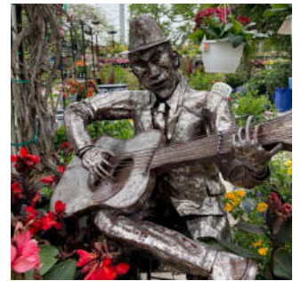
Garden Art at Living Color