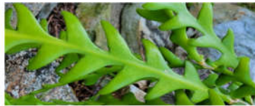
Ric- rack Cactus stems