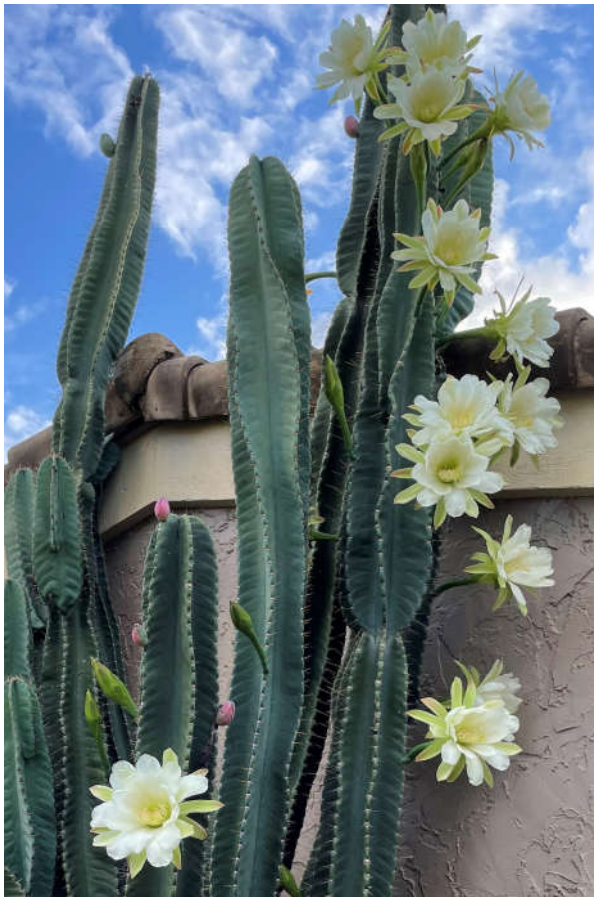
Cereus hexagonus, Lady of the night. There are 33 different species of this cactus. It thrives in full sun and partial shade. It begins to bloom when it is 4-5 years old. This variety grows to 20 ft.

Orchid Cactus - There are a few groups of cacti that have very similar flowers and similar common names such as lady of the night and queen of the night. The Epiphyllum family is a large group of hanging cactus plants, and the Cereus family are upright. Both are easy to propagate from stem/leaf cuttings.