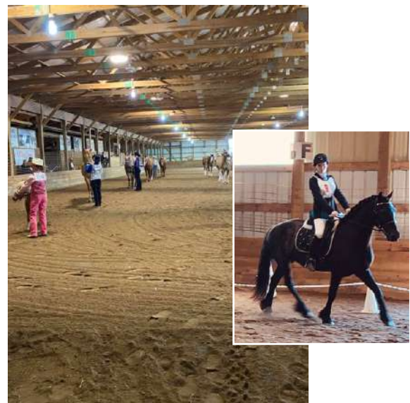
Driving pictures not available

Stabling as well as overnight camping is available.