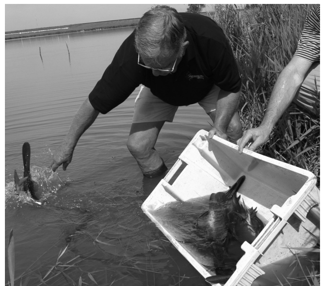
Figure 2. Stocking paddlefish fingerlings.