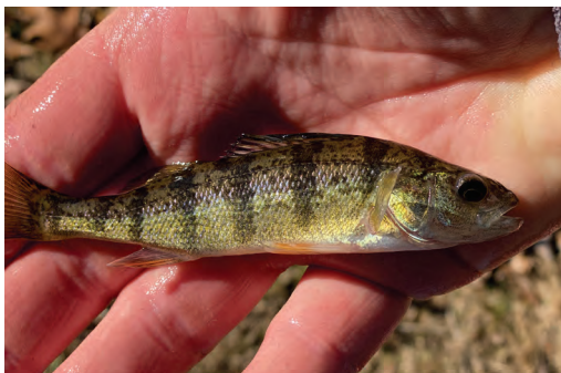
Yellow Perch stocked into Alpine

Fish stocking occurred twice this past year to enhance the forage base and genetics within our lakes. In the spring, we stocked fish into Lake Alpine, Aspen, Klor, Innsbrook, and Frieden. This fall cool water species such as walleye (Wanderfern), smallmouth bass (Alpine) and black crappie (Aspen) were stocked. Walleye are stocked to control green sunfish. Please remember walleye and smallmouth are catch and release. We also introduced yellow perch into Alpine and Klor Lake. A pair of northern pike were donated for Lake St. Gallen. Our efforts over the last few years have shown a significant improvement in the number, size, and quality of fish.